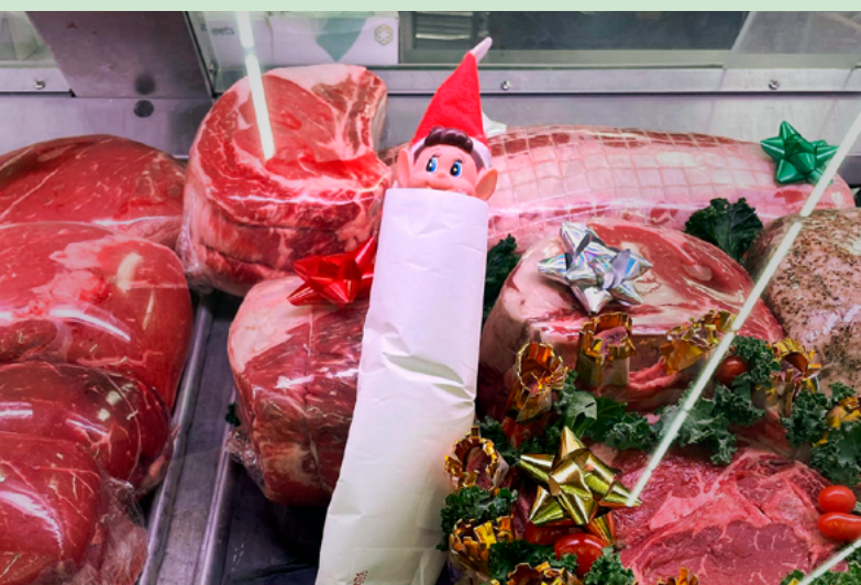
"I hope whoever put me in here knows that I absorb odors easily."