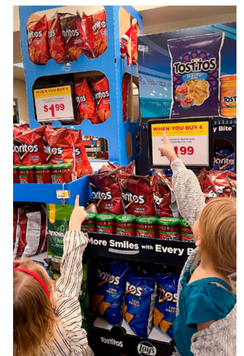
"What are you pointing at? That's not yo' cheese."

HD: As I mentioned last year, Santa thinks there's a future for me in the home office so after I graduate from CSUSB, the plan is to have me based mainly out of the North Pole. Like Stater Bros., Santa's Workshop has deeply rooted traditions and that's great because it gives us a strong foundation and identity, but there are downsides to that too, like stifling innovation and being slow to react to new challenges.