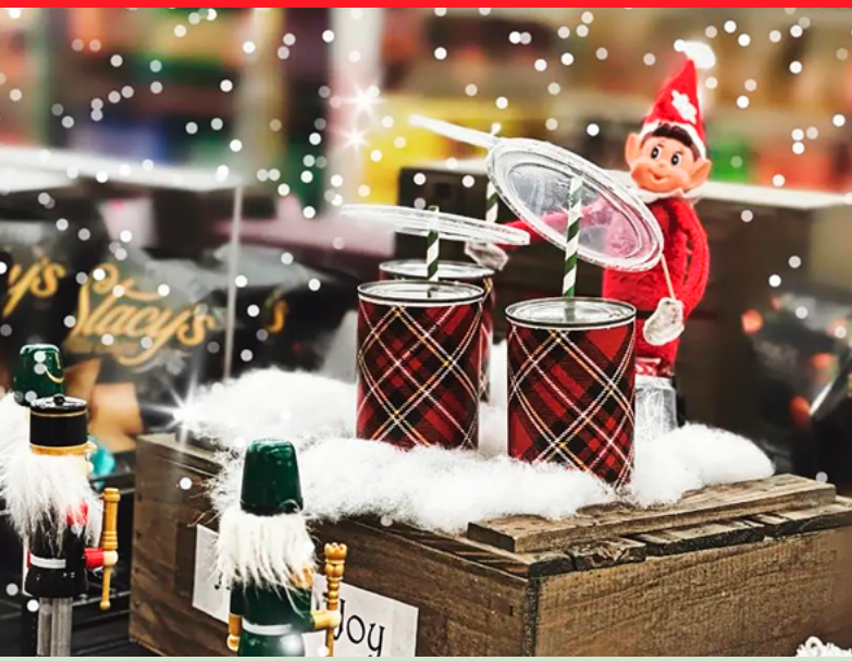
The Little Drummer Elf entertains several nutcrackers.

HD: I think I'm going to pay a visit to your new Chino store in a community called The Preserve. The elf that's stationed there told me that there's a lot of new stuff there. When I heard that they have things like soy garlic Korean chicken wings and Japanese milk bread sandwiches, I knew I'd have to check it out.